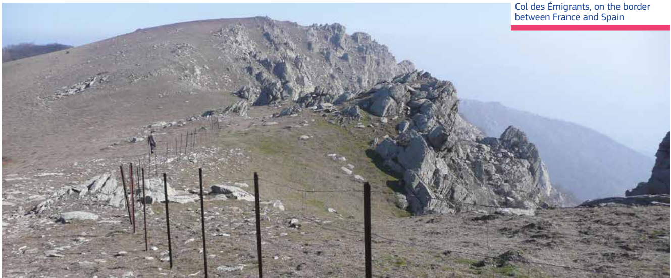
Col des Émigrants, on the border between France and Spain