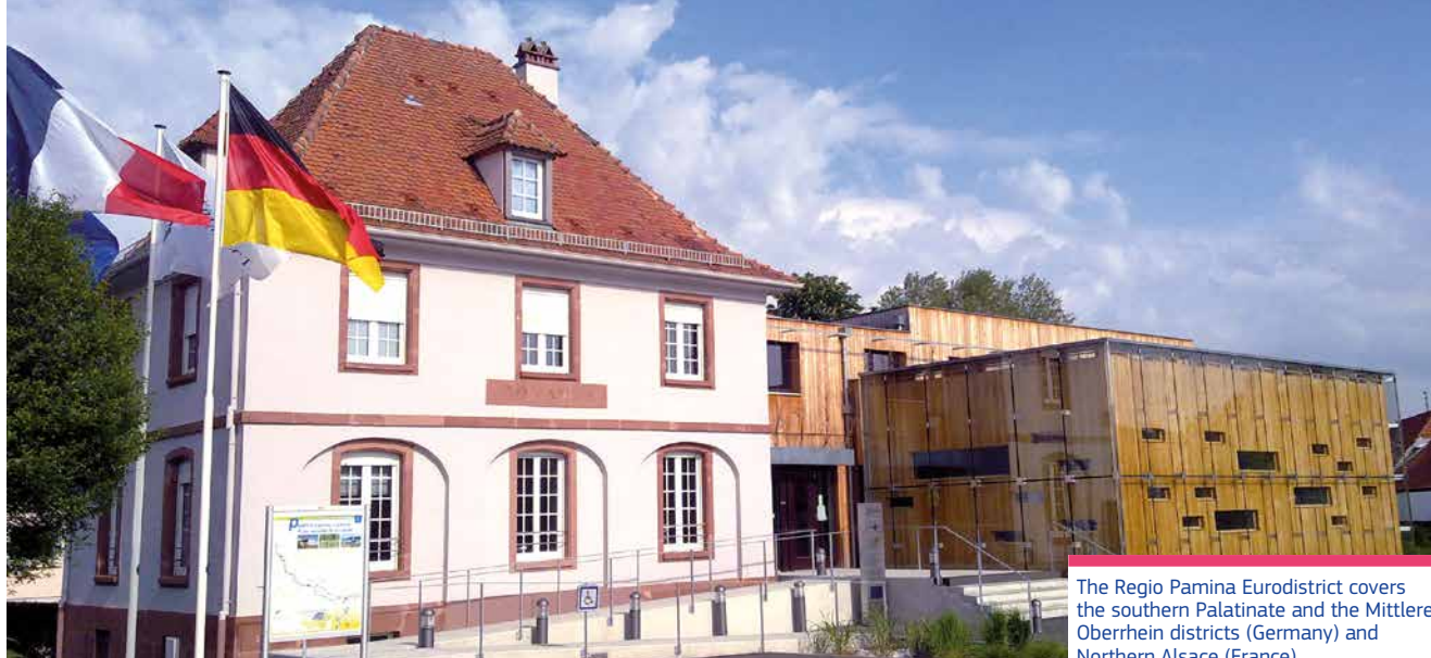
The Regio Pamina Eurodistrict covers the southern Palatinate and the Mittlerer Oberrhein districts (Germany) and Northern Alsace (France)

of Basel. From 1991 onwards, this cooperation was managed by the Upper Rhine Conference based in Kehl in Germany. It was enlarged in 2000 to include the five cantons in north-western Switzerland (the two Half-Cantons of Basel and the Cantons of Aargau, Jura and Solothurn), under a new intergovernmental agreement signed in Basel. Finally, the Trinational Metropolitan Region of the Upper Rhine was created in 2010 in order to put proper multilevel governance in place in the cross-border area. This governance was also designed to involve the local cooperation associations which started to emerge after 2000. Four eurodistricts have been created in the region. The first, the Strasbourg-Ortenau Eurodistrict (2005), was launched by Jacques Chirac and Gerhard Schröder during the 40th anniversary celebrations of the Élysée Treaty in Strasbourg and Kehl in 2003. The Regio Pamina, set up as a local cross-border cooperation grouping in 2001, was converted to a eurodistrict at the same time. These were followed by the Freiburg Region/Central and Southern Alsace Eurodistrict in 2005 and the Basel Trinational Eurodistrict in 2007.