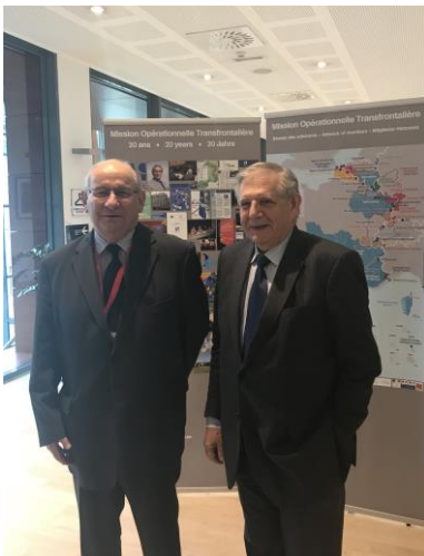
Michel Delebarre, President of the MOT, former Minister of State (left), and Jacques Mézard, French Minister for Territorial Cohesion (right), at the MOT's European Conference.